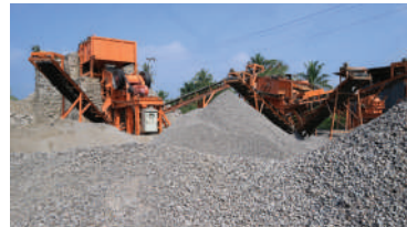
Stone Crushing Process

Crown Enterprise is always devoted to supply premium quality stone to its valuable customers. To maintain quality products the company deploys experienced and highly skilled personnel in the particular field to monitor the entire process – quarrying, crushing process, mother vessel loading etc. For quality assurance, our imported stones are always tested and certified by Bangladesh University of Engineering and Technology (BUET).